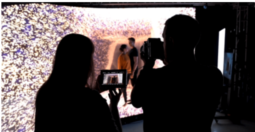
Image 4 - Northern Ballet using an LED volume at Production Park, West Yorkshire

young families and mums and getting back into work. I think that's a lot more achievable [with virtual production] because I completely get it if you're a young parent, you don't want to be travelling for three months leaving the baby at home doing all that kind of stuff. But if it's a [virtual production] studio 30 minutes down the road, that's just like going to work'