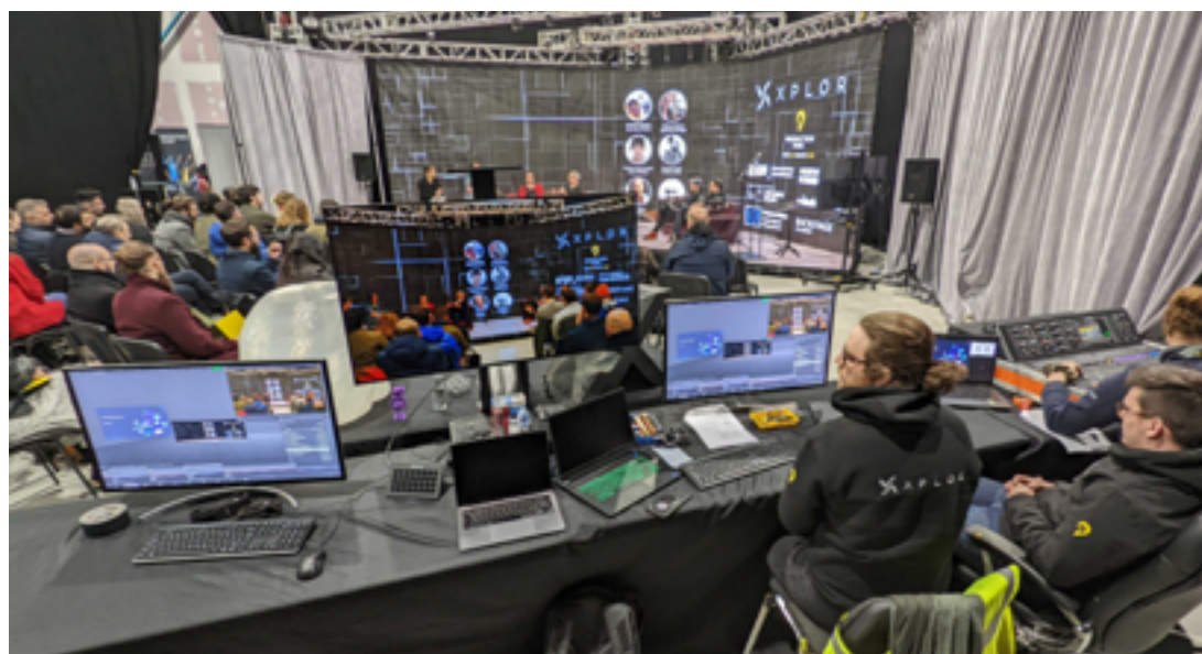
Image 1 - Production Park/Xplor's 'brain bar' and LED volume

We also attended two industry events which had a focus on virtual production. Following in person networking at these events, follow up emails were sent to the companies and individuals who had been approached during the shows. From these two recruitment strategies, we then snowball sampled additional participants.